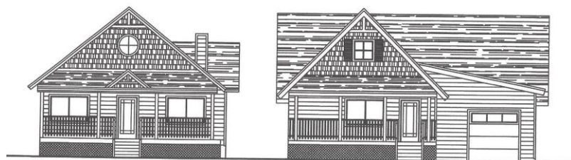
San Jose Avenue Street View

RELATED SUGAR PINE VILLAGE STUDIO SQUARE 5.20.2020